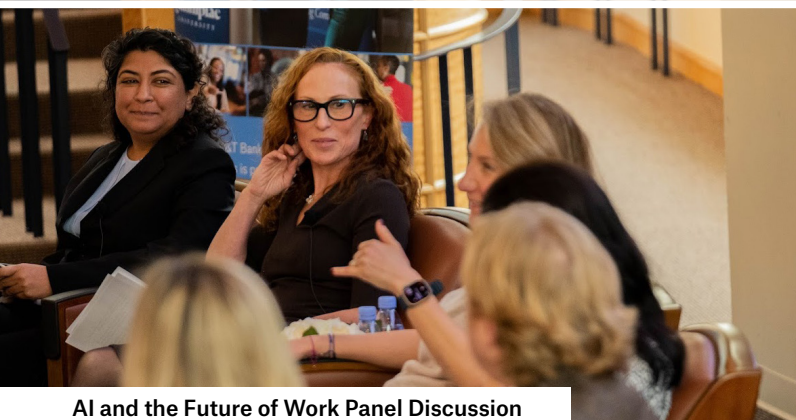
AI and the Future of Work Panel Discussion