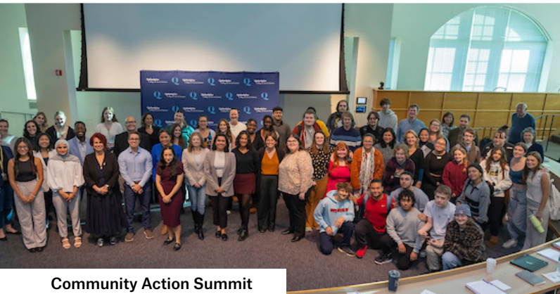
Community Action Summit