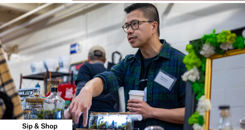
Sip & Shop