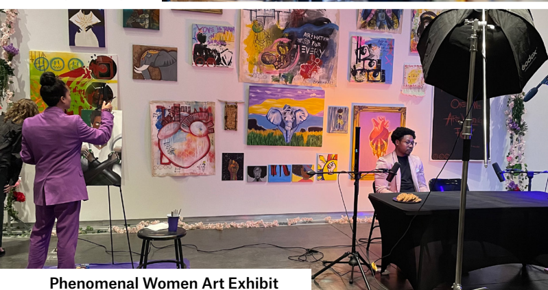
Phenomenal Women Art Exhibit