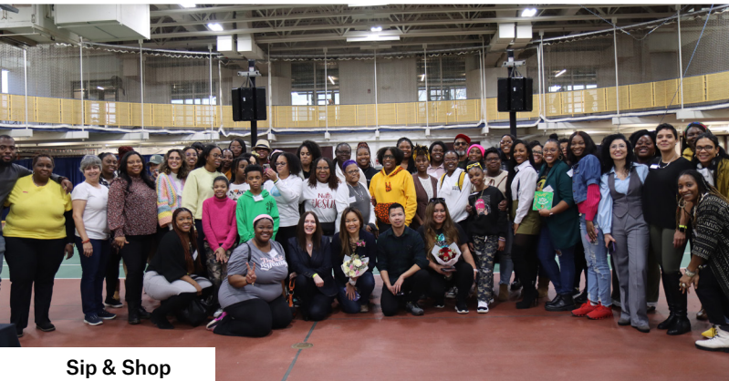
Sip & Shop