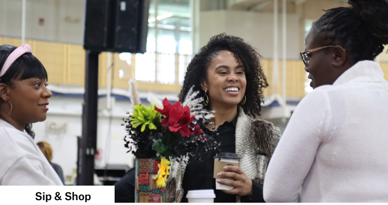
Sip & Shop