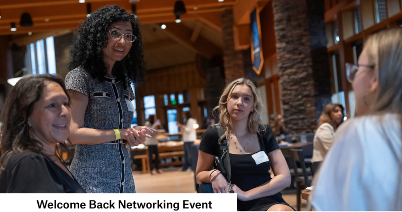
Welcome Back Networking Event